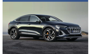
Audi e-tron Sportback