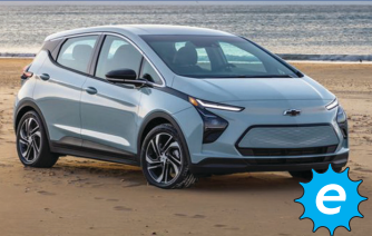
Chevy Bolt EV