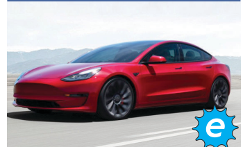
Tesla Model 3