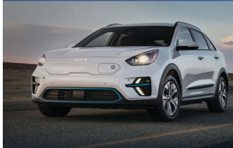
Kia Niro EV