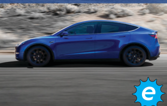
Tesla Model Y