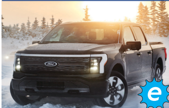
Ford F-150 Lightning