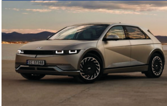
Hyundai Ioniq 5