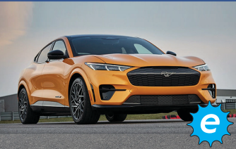
Ford Mustang Mach E