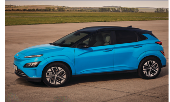
Hyundai Kona Electric