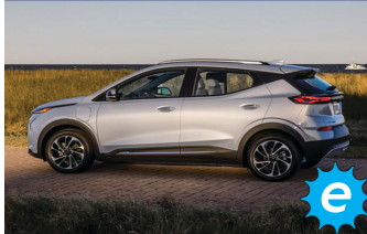
Chevy Bolt EUV