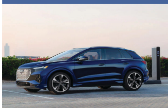
Audi Q4 e-tron