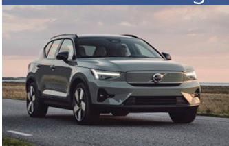
Volvo XC40 Recharge